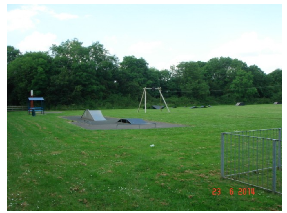
Figure 2 Looking north from corner of Windmill Park play area. Cableway-Zip Line, Cycle Box and BMX ramps.