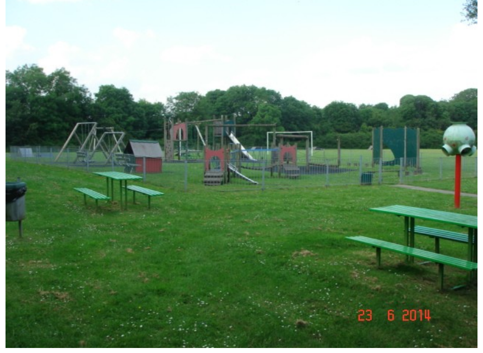
Figure 3 Windmill Park, the fenced play area for younger children. In the foreground, picnic benches.